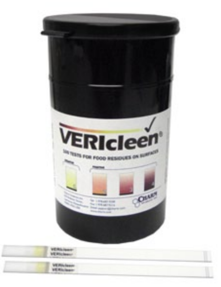
VERIcleen® Test Kit

"In all cases, the results obtained were consistent and easy to interpret and were attainable within one minute of sampling the surface" [Figure 1]