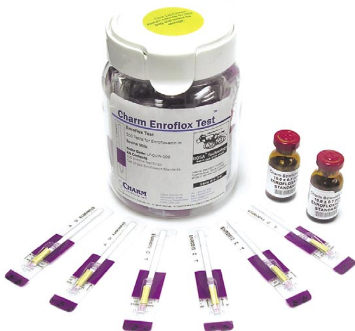
Enroflox Test Kit