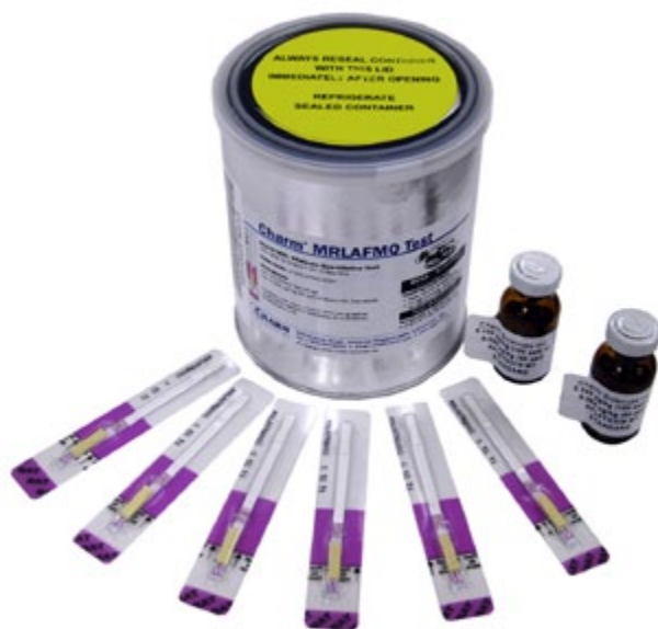
Charm MRL Aflatoxin Quantitative Test Kit for Milk Includes 50 ppt Aflatoxin M1 Standard(s)